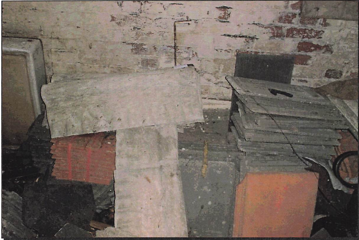
Photograph Number: 16