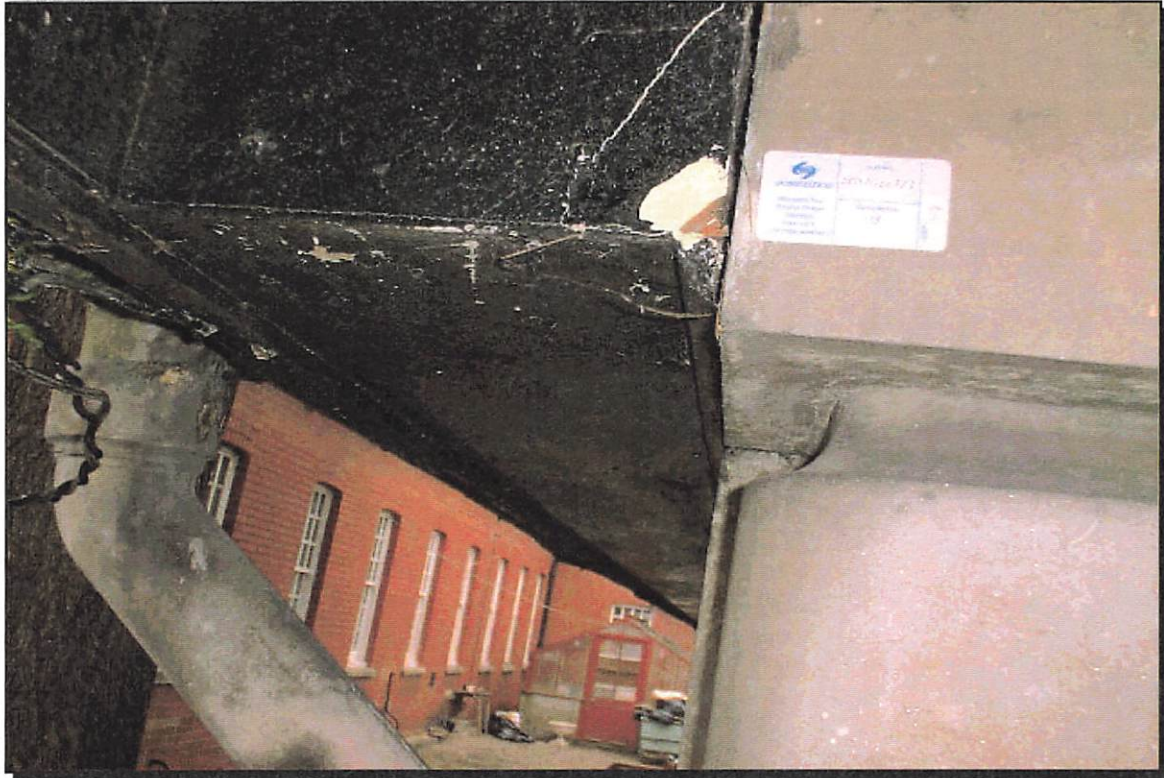
Photograph Number: 44