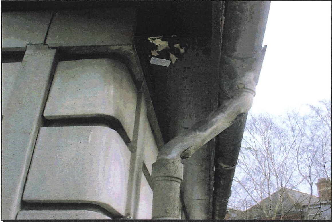
Photograph Number: 45