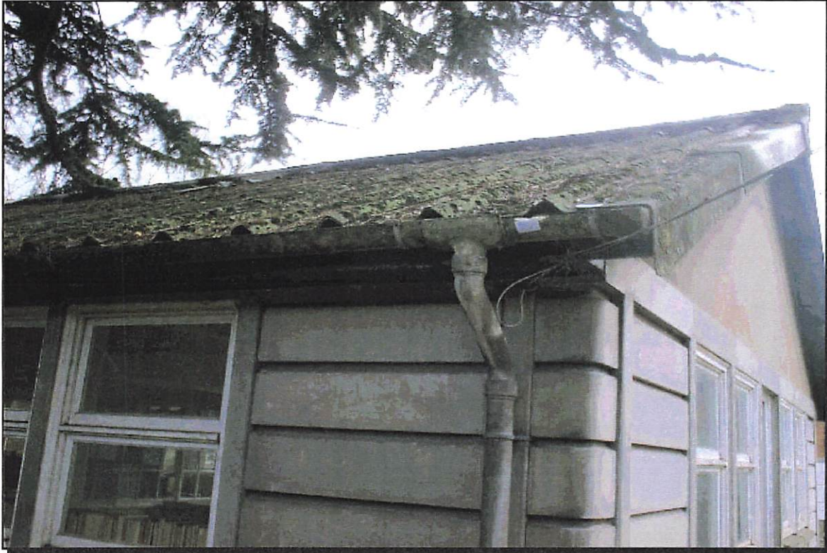
Photograph Number: 43