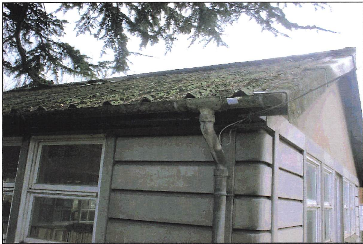
Photograph Number: 43