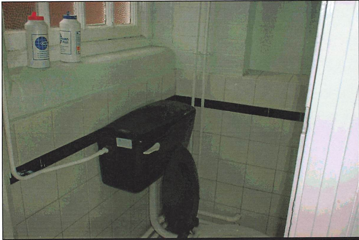
Photograph Number: 22

Site ID: DEA/01283/3/WORK Location ID: 01283/3/67 Building: Floor: Room / Area: Locker room/WC (160) Description: Toilet cistern