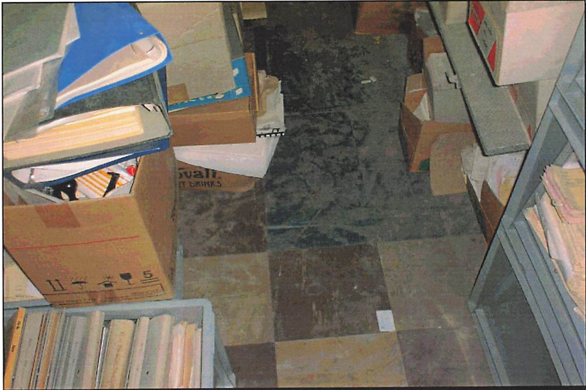
Photograph Number: 18

Site ID: DEA/01283/3/WORK Location ID: 01283/3/64 Building: Floor: Room / Area: Store (room 003) Description: Floor tiles