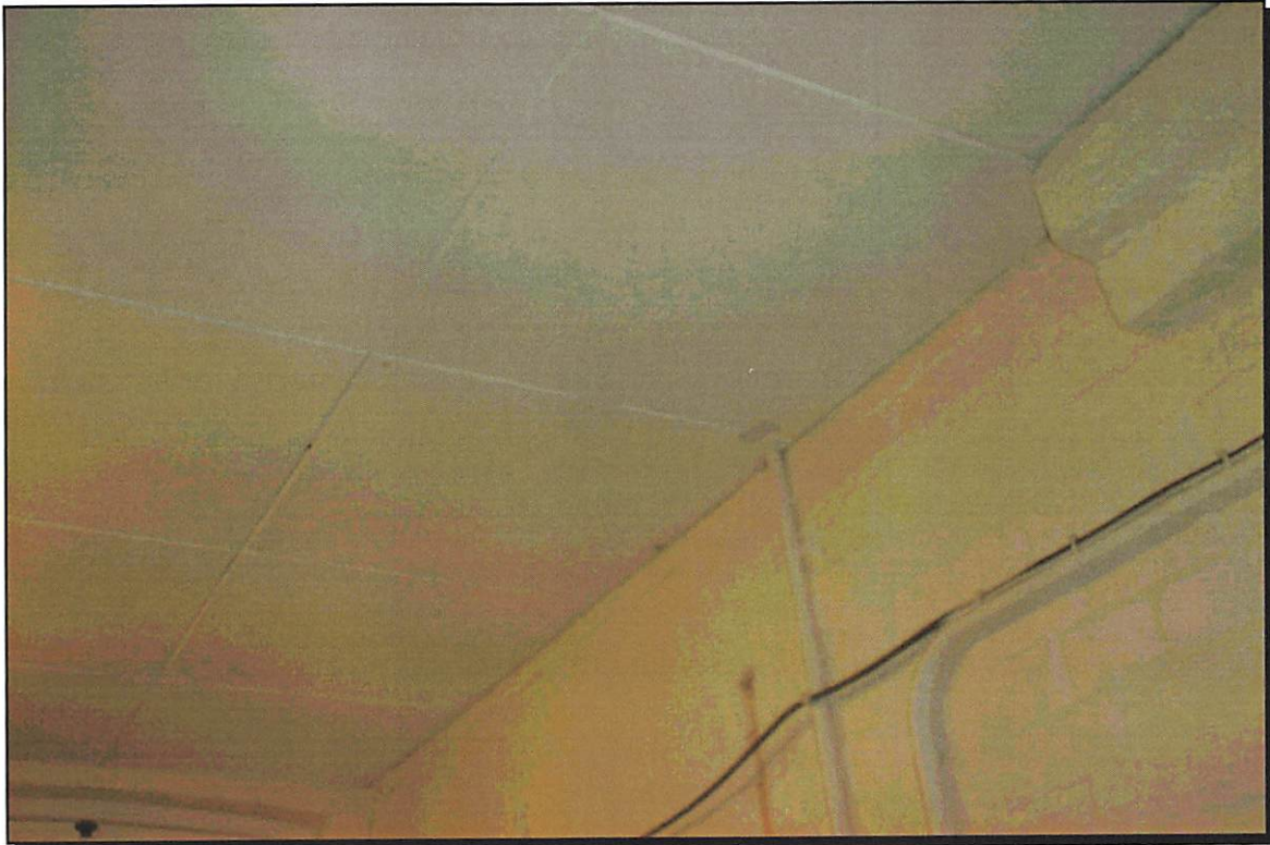
Photograph Number: 23

Site ID: DEA/01283/3/WORK Location ID: 01283/3/68 Building: Floor: Room / Area: Engineers office (161) Description: Ceiling tiles