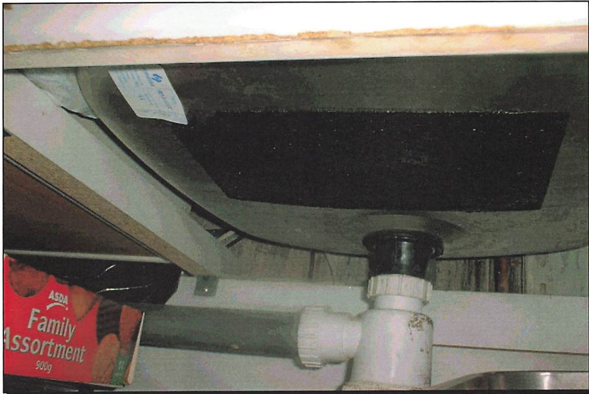
Photograph Number: 21

Site ID: DEA/01283/3/WORK Location ID: 01283/3/66 Building: Floor: Room / Area: Rest room (156) Description: Sink pad