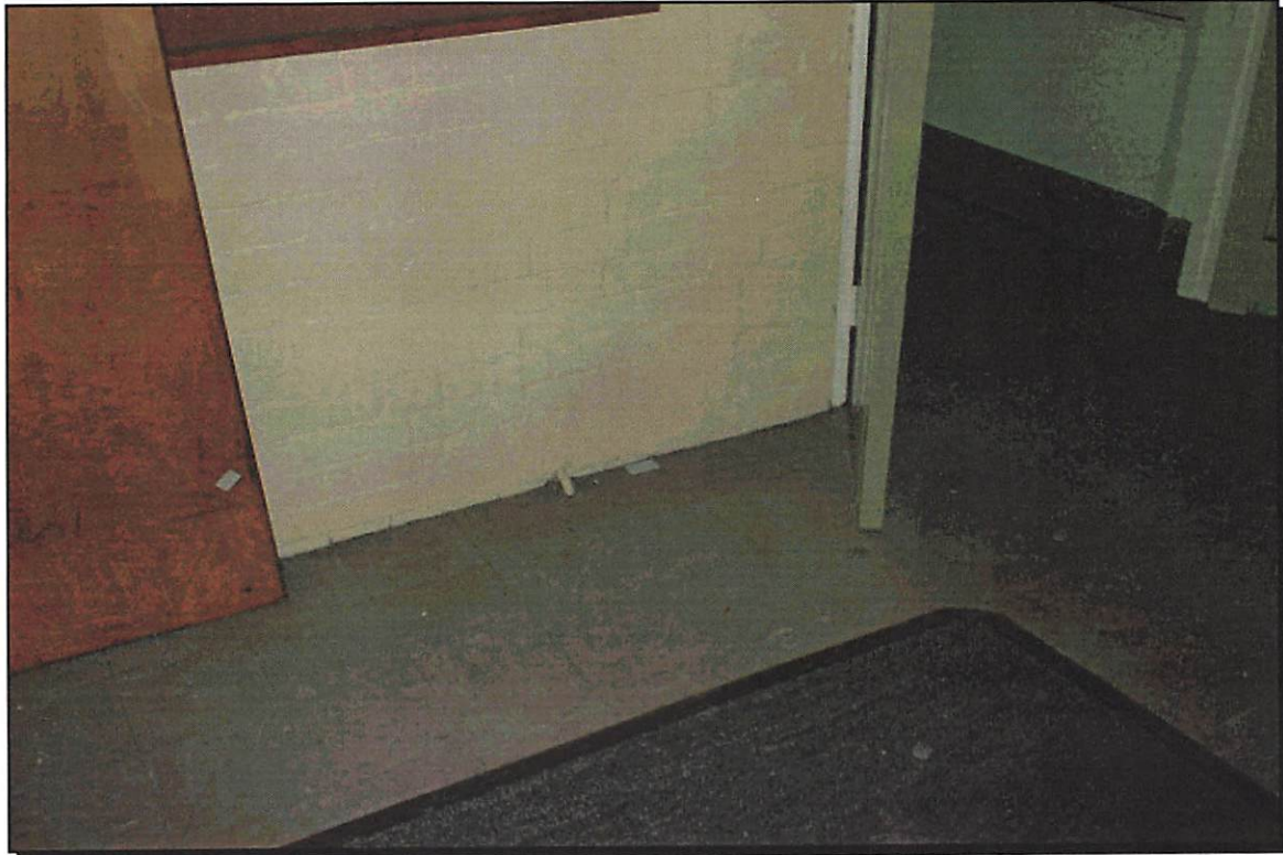
Photograph Number: 20

Site ID: DEA/01283/3/WORK Location ID: 01283/3/65 Building: Floor: Room / Area: Lobby (0155) Description: Floor tiles