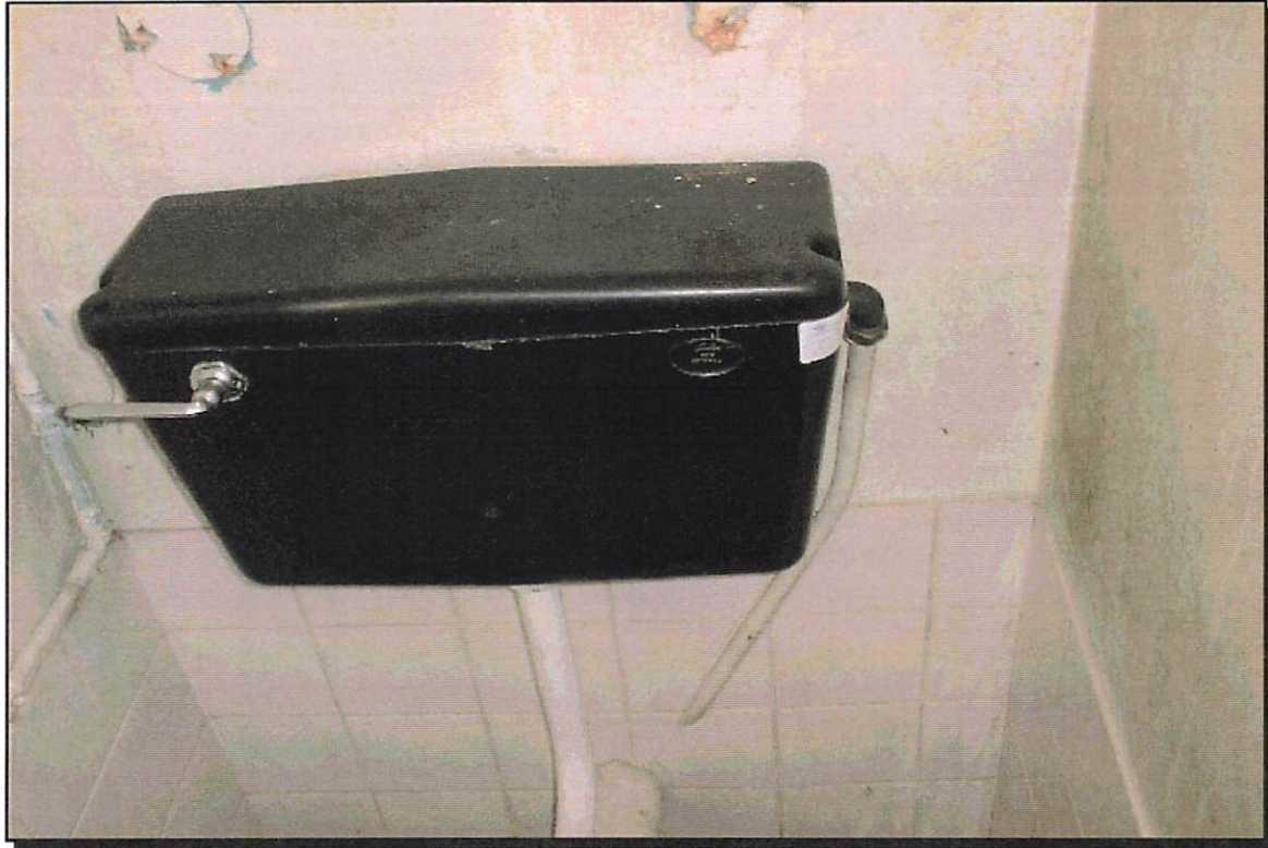
Photograph Number: 06

Site ID: DEA/01283/3/MALPAS Location ID: 01283/3/098 Building: Floor: Ground Room / Area: WC (G020) Description: New Reverso cistern