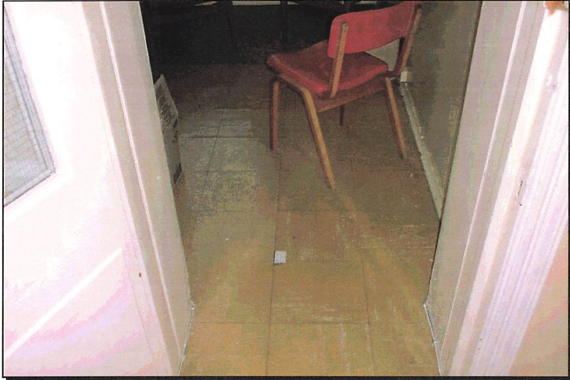
Photograph Number: 04