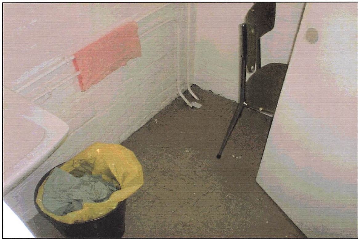
Photograph Number: 7