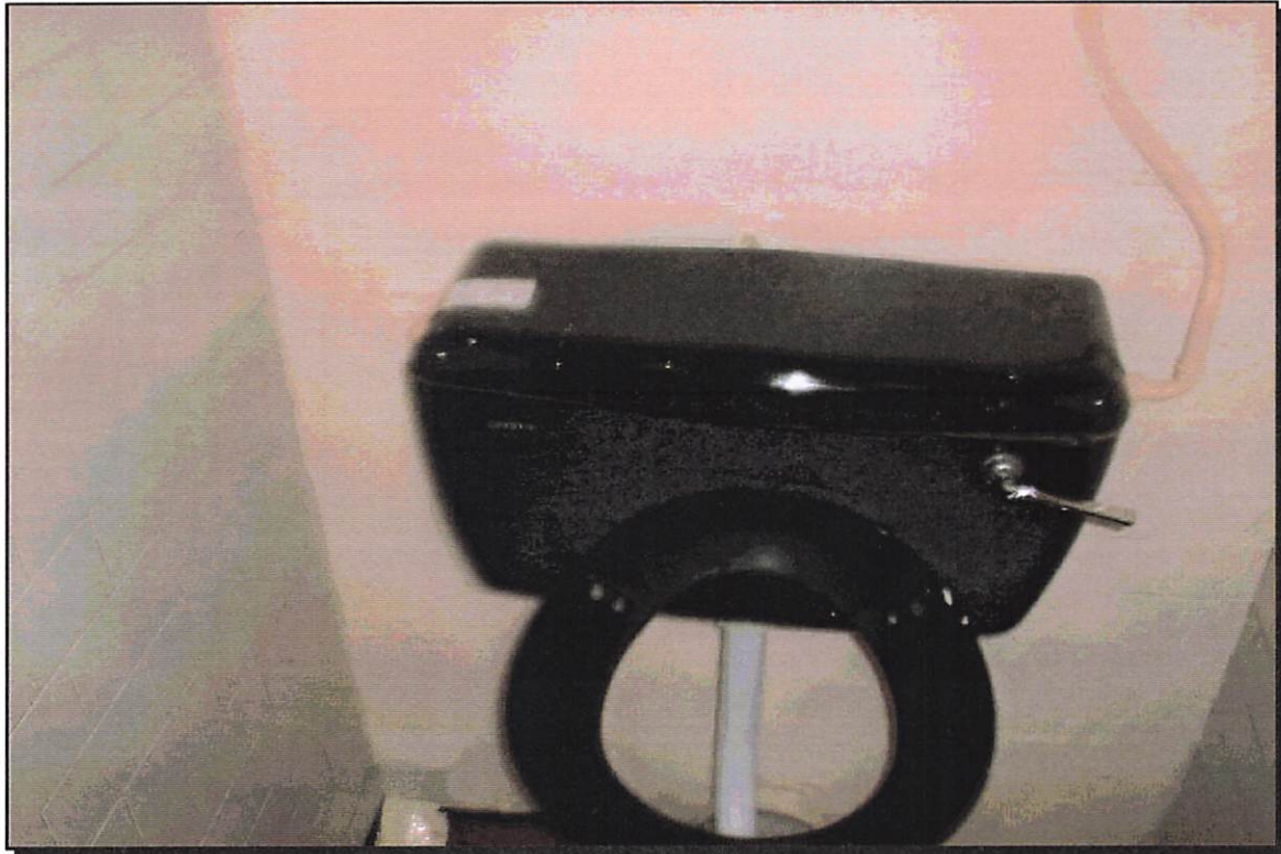
Photograph Number: 05