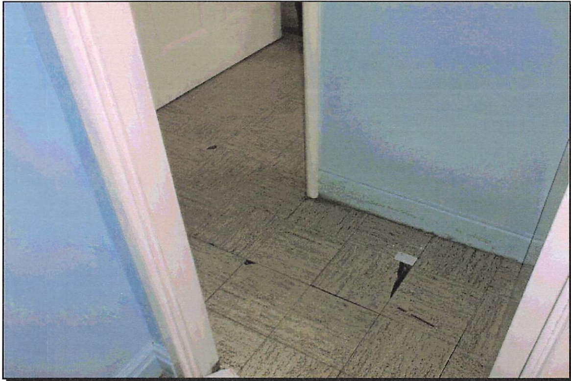
Photograph Number: 08