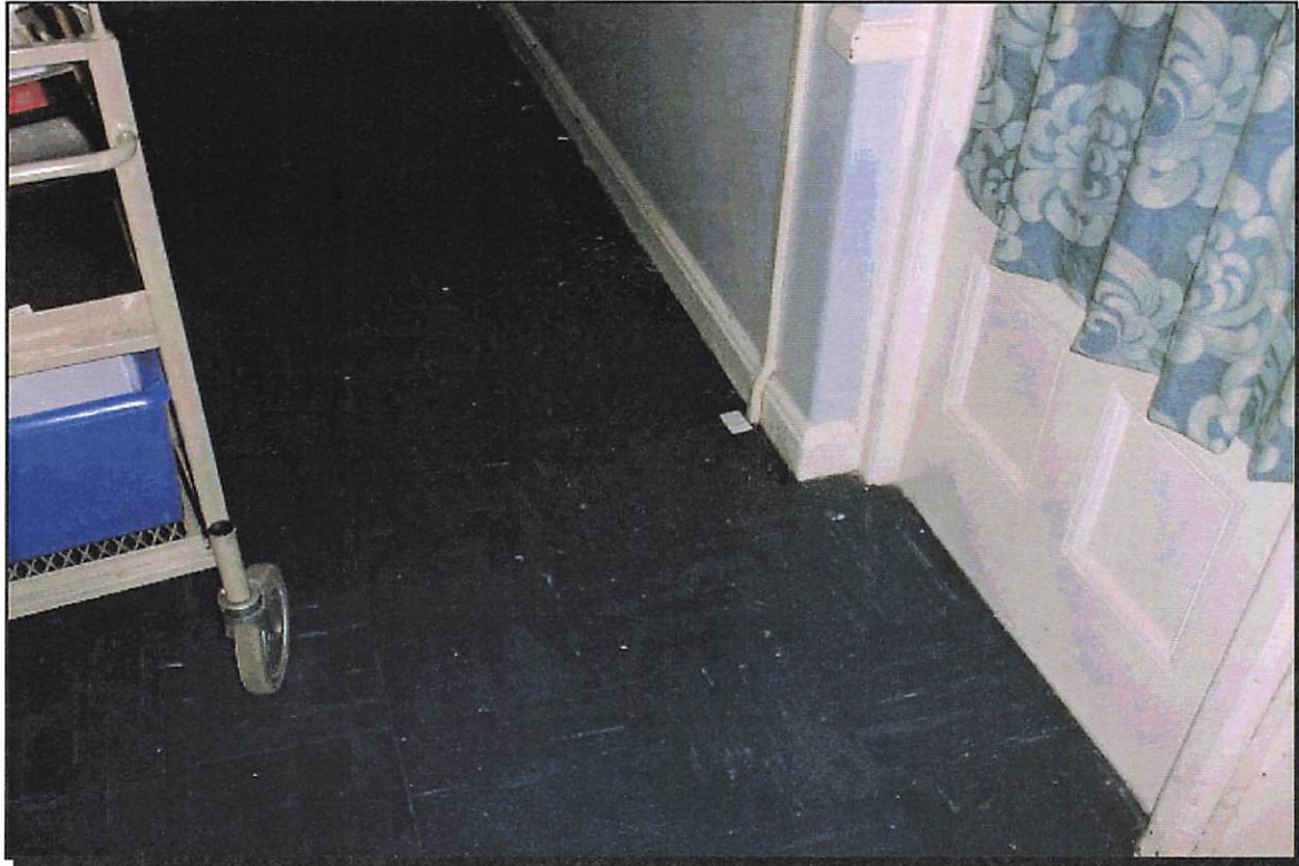
Photograph Number: 04