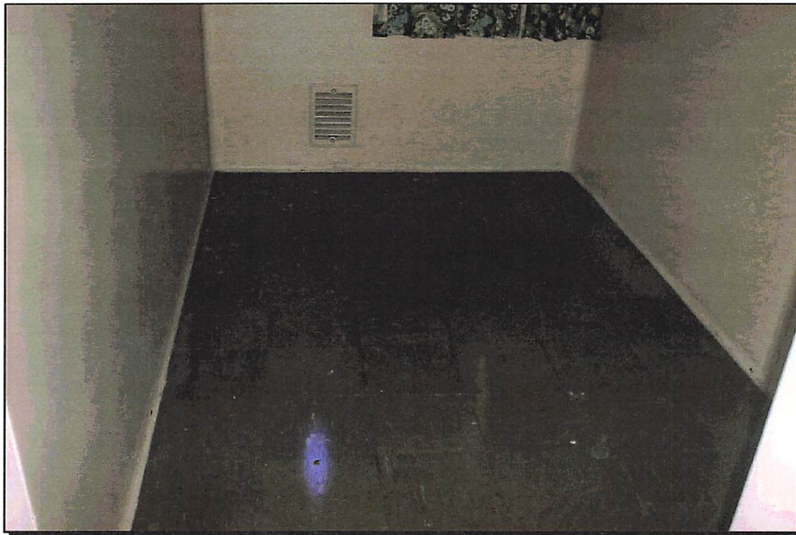
Photograph Number: 03