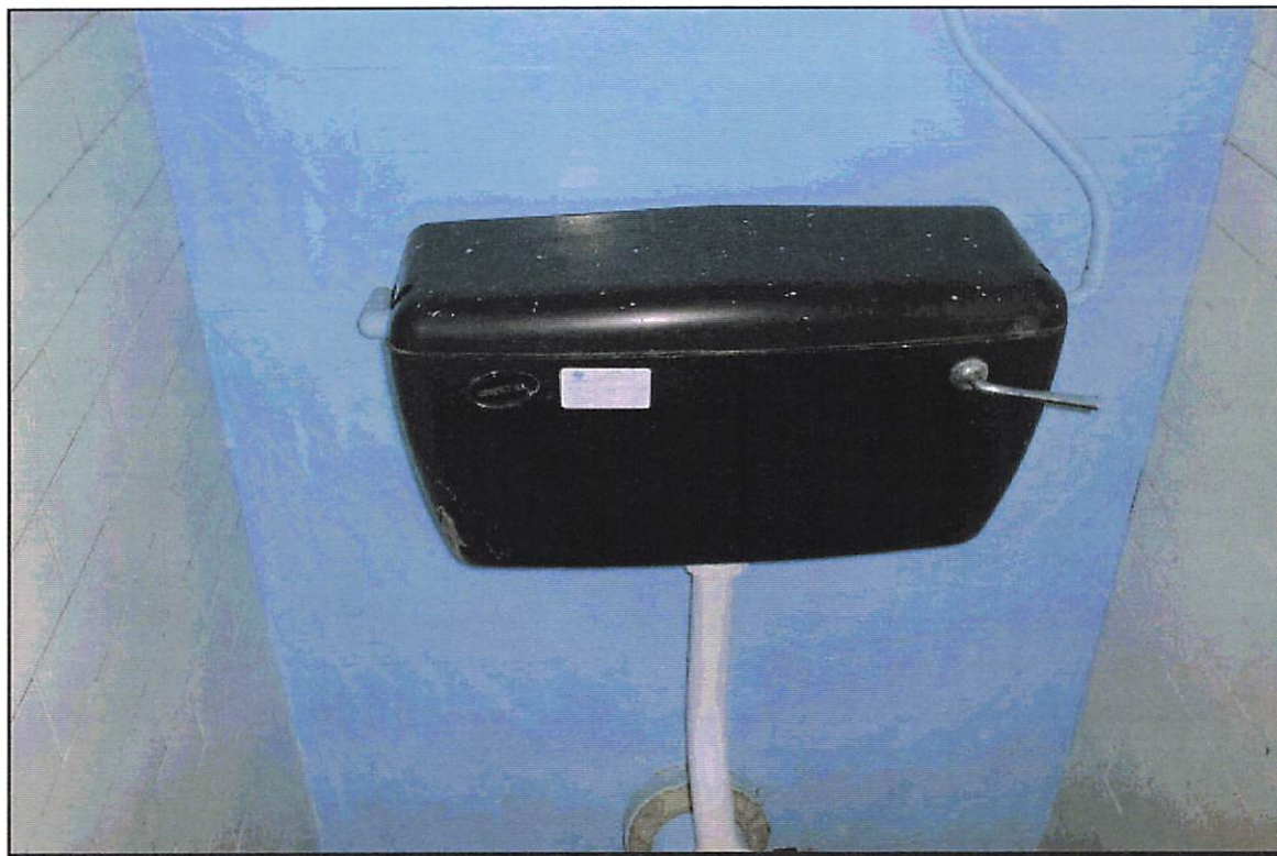
Photograph Number: 9