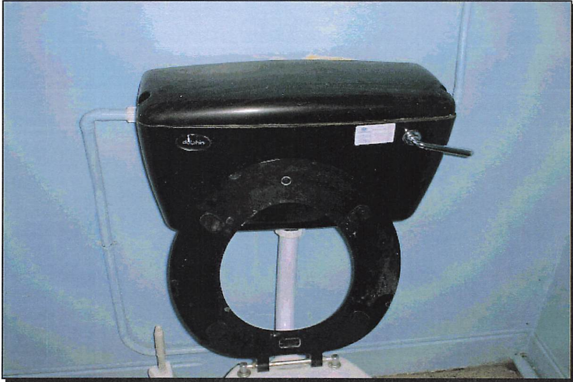
Photograph Number: 06

Site ID: DEA/01283/3/BEL Location ID: 01283/3/05 Building: Floor: 1 Room / Area: Room A115 WC Description: Bakelite cistern