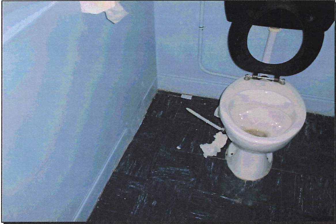
Photograph Number: 7