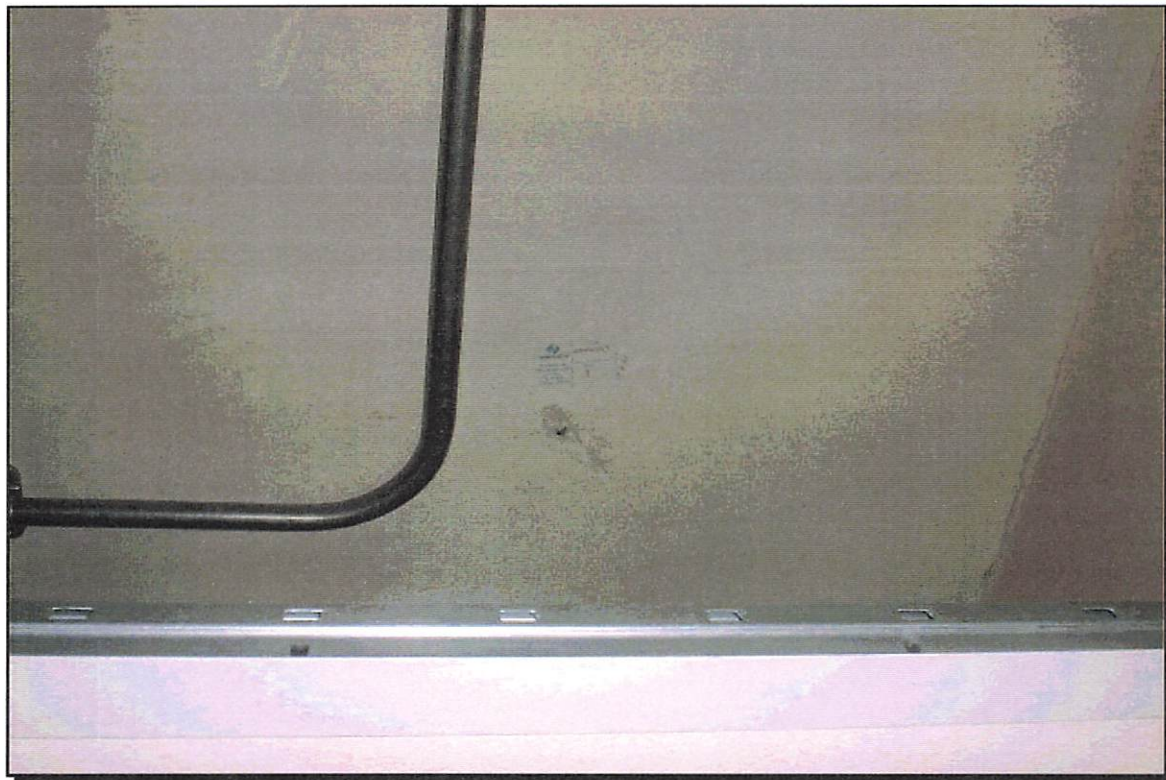
Photograph Number: 10