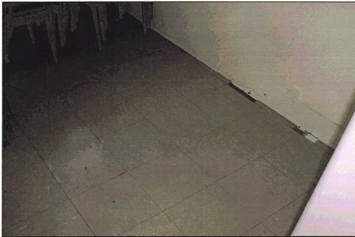
Photograph Number: 05