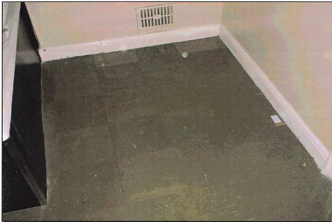
Photograph Number: 02