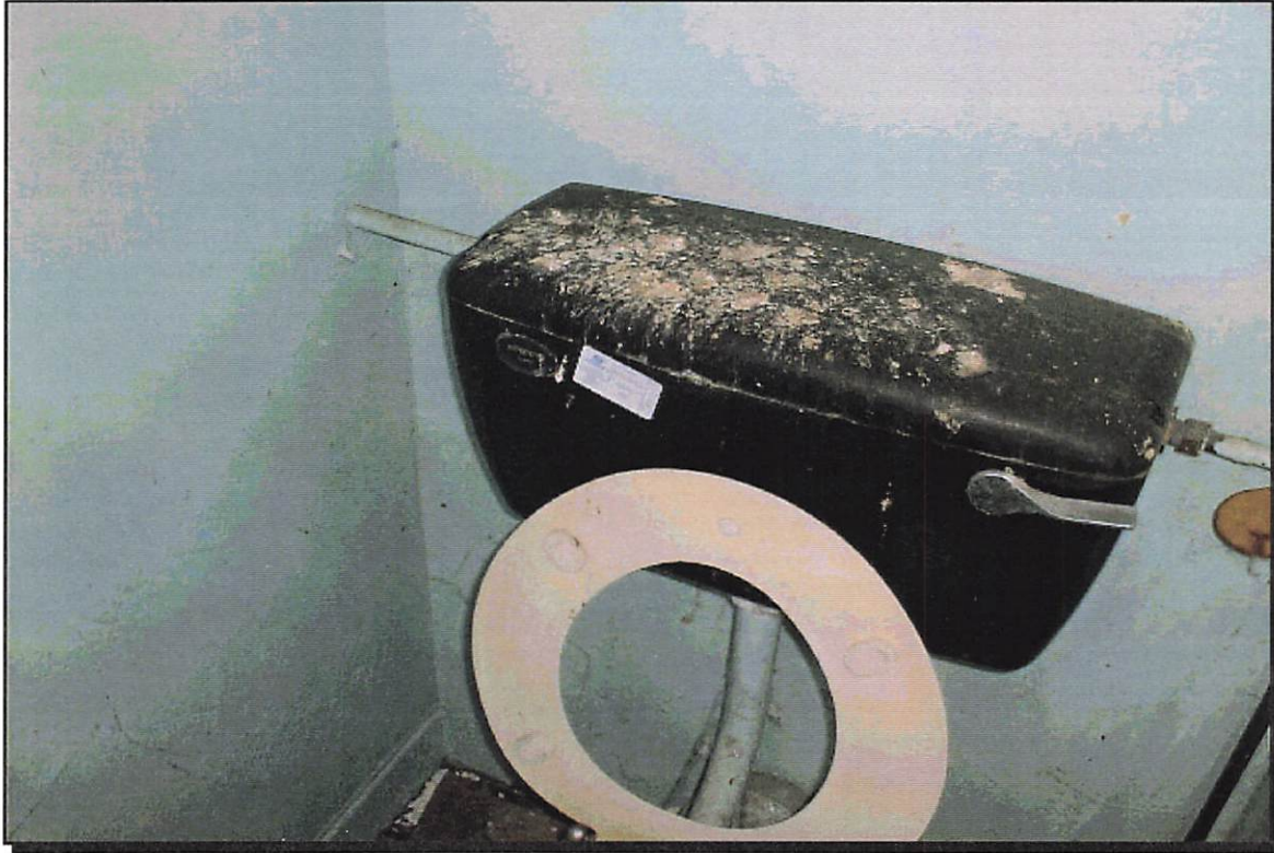
Photograph Number: 01