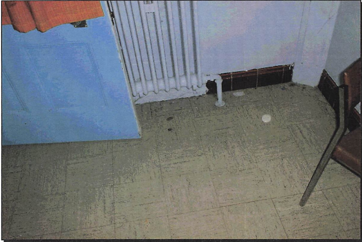
Photograph Number: 35

Site ID: DEA/01283/3/BET Location ID: 01283/3/33 Building: Floor: Ground Room / Area: Room A026 Description: Smaller beige floor tiles