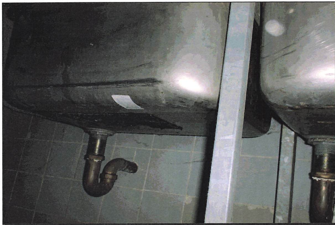
Photograph Number: 36