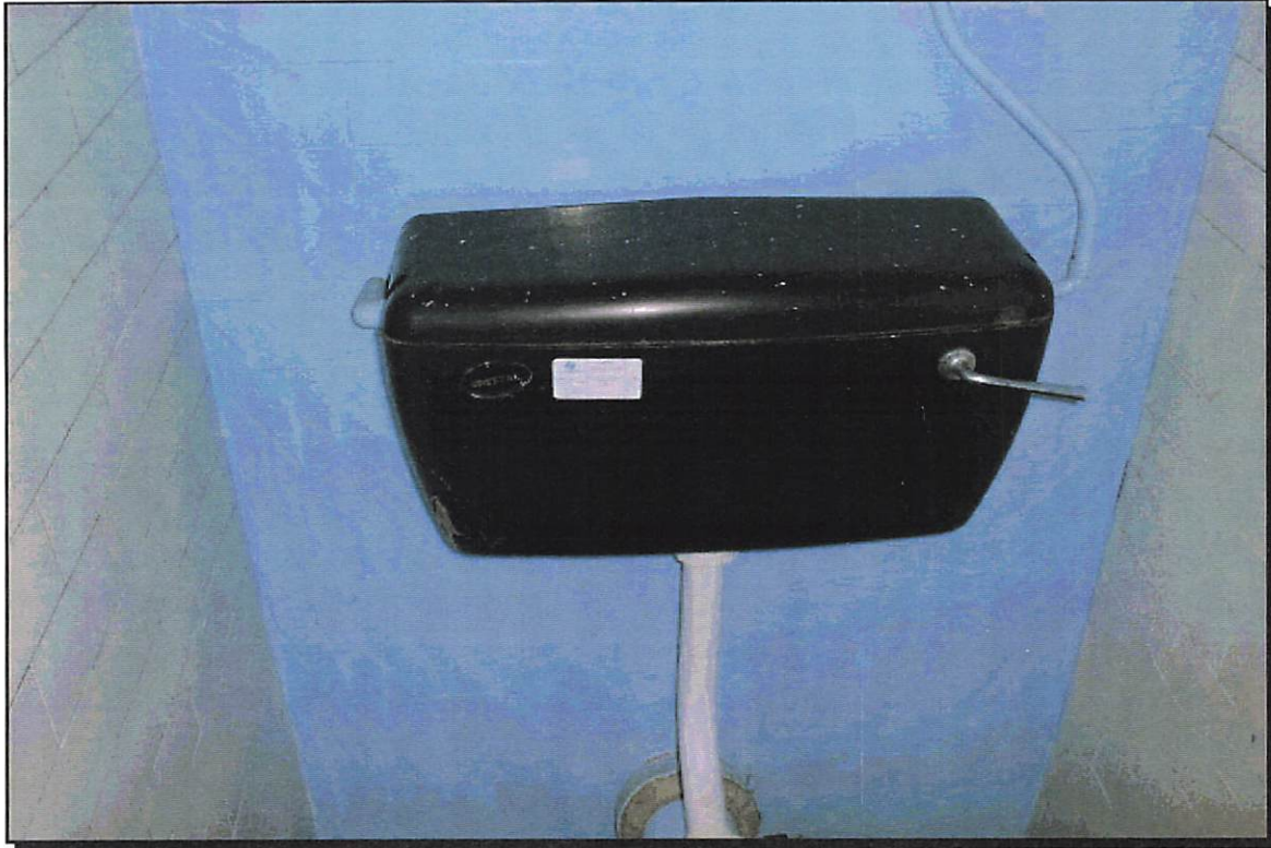
Photograph Number: 9

Site ID: DEA/01283/3/BET Location ID: 01283/3/08M Building: Floor: Ground Room / Area: A014 Description: 'Crystal' cistern