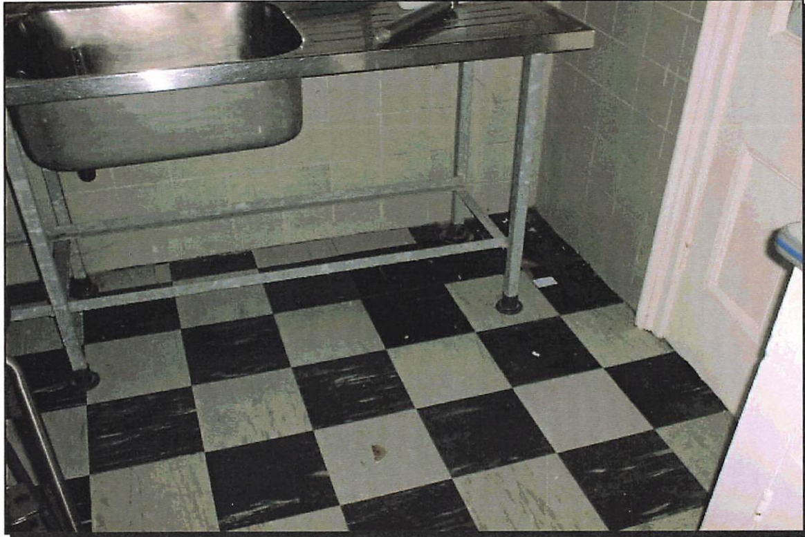
Photograph Number: 37

Site ID: DEA/01283/3/BET Location ID 01283/3/35 Building Floor Ground Room / Area Kitchen A016 Description Floor tile