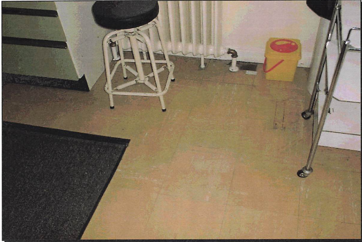
Photograph Number: 34

Site ID: DEA/01283/3/BET Location ID: 01283/3/32 Building: Floor: Ground Room / Area: Room A001A Description: Floor tiles