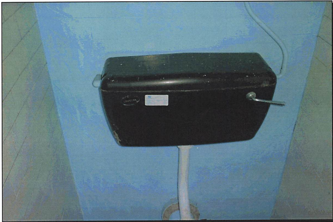
Photograph Number: as 8M

Site ID: DEA/01283/3/BRYN Location ID: 01283/3/B016/8M Building: Floor: Ground Room / Area: Room B016 WC Description: Cystal/SWB cisterns