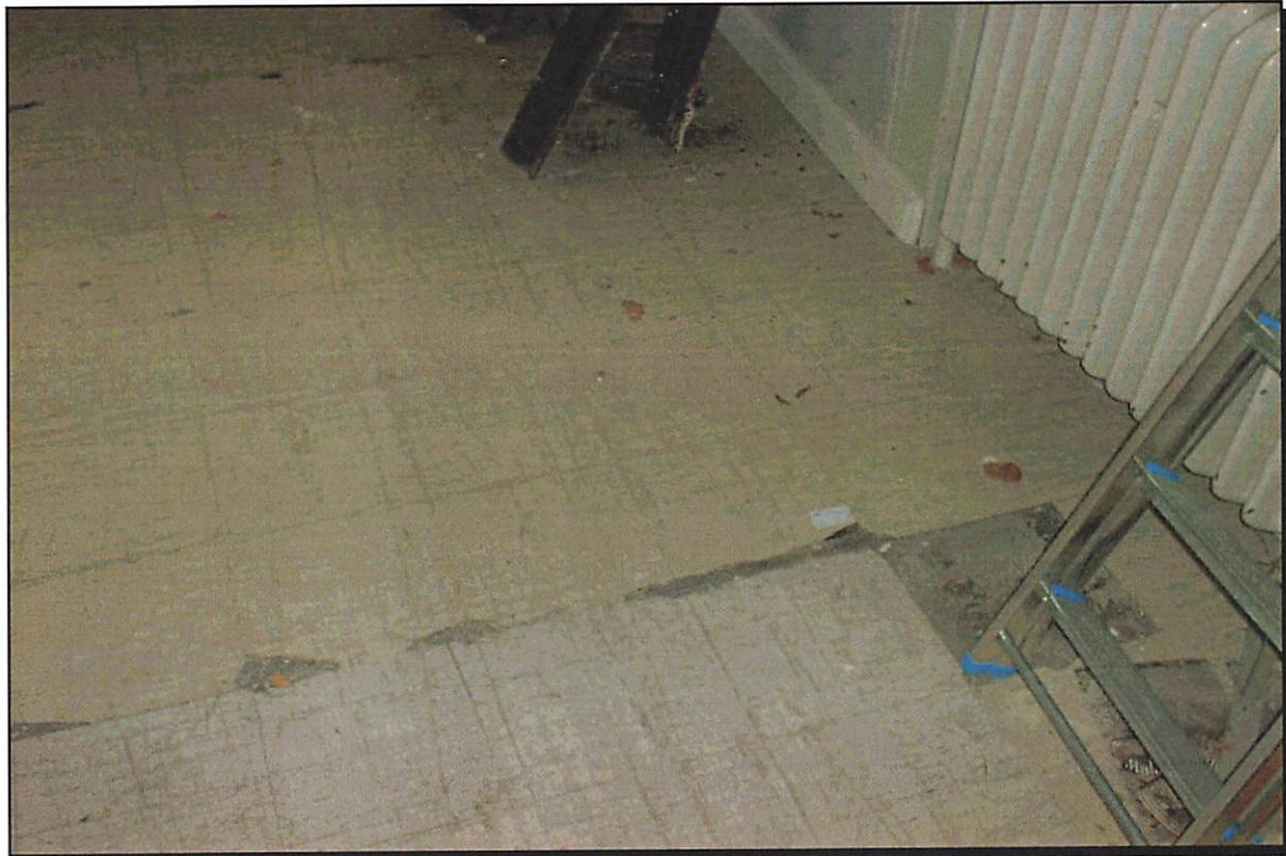
Photograph Number: 39

Site ID: DEA/01283/3/BRYN Location ID: 01283/3/37 Building: Floor: Ground Room / Area: Corridor B027 Description: Beige floor tiles