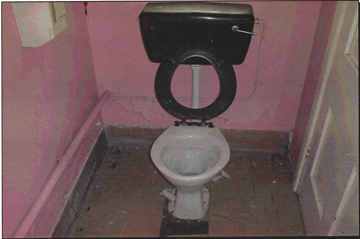
Photograph Number: 41

Site ID: DEA/01283/3/BRYN Location ID: 01283/3/38M Building: Floor: Ground Room / Area: Room B024 WC Description: Brown floor tiles