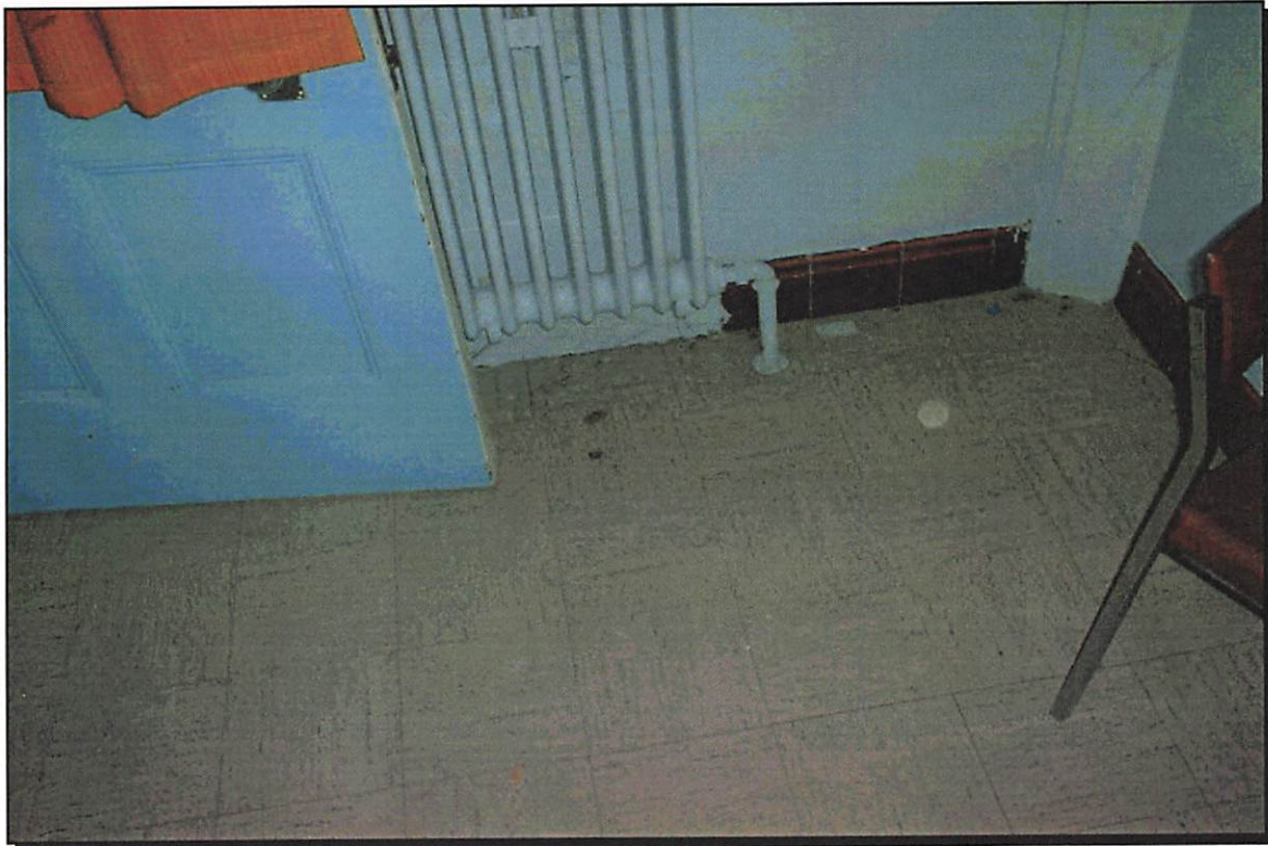
Photograph Number: as 35

Site ID: DEA/01283/3/BRYN Location ID: 01283/3/33M Building: Floor: Ground Room / Area: B026 Description: Floor tiles