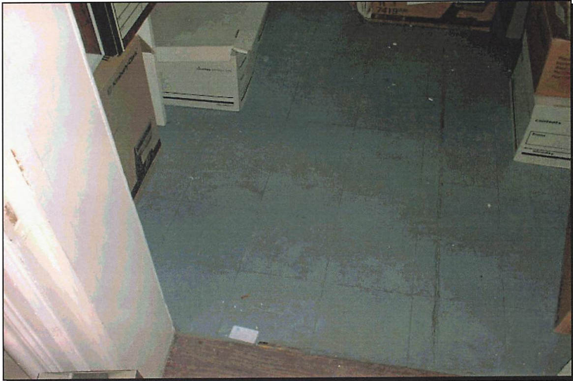
Photograph Number: 40

Site ID: DEA/01283/3/BRYN Location ID: 01283/3/38 Building: Floor: Ground Room / Area: Room B022 Description: Blue floor tiles