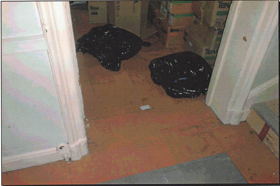
Photograph Number: 38

Site ID: DEA/01283/3/BRYN Location ID: 01283/3/36 Building: Floor: Ground Room / Area: Room B001 Description: Orange/brown floor tiles