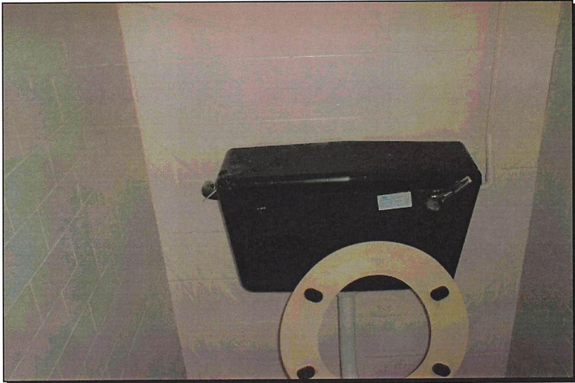
Photograph Number: as 31

Site ID: DEA/01283/3/BRYN Location ID: 01283/3/30M Building: Floor: Ground Room / Area: Room B003 WC Description: SWB cistern