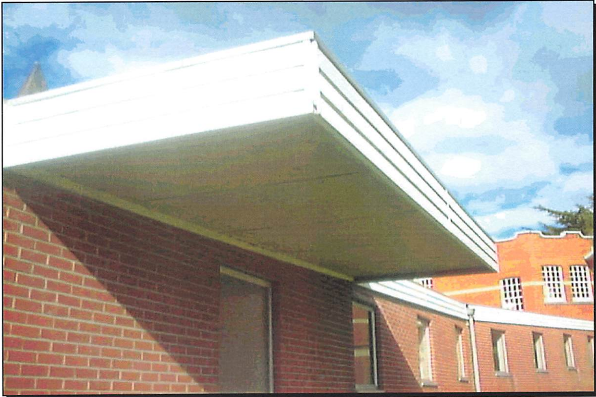
Photograph Number: 16

Site ID: DEA/01283/3/GLEN Location ID: GLEN/125 Building: Floor: Room / Area: Porch exterior Description: Soffit board