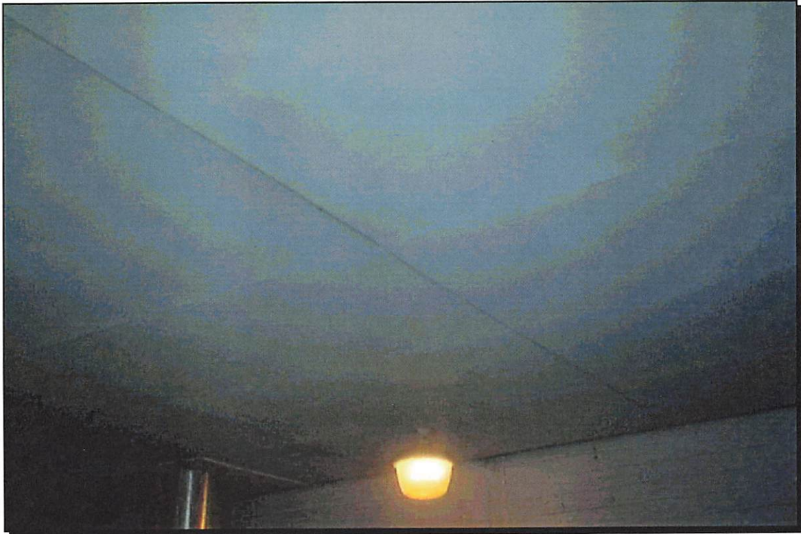
Photograph Number: 3

Site ID: DEA/01283/3/GLEN Location ID: GLEN/111 Building: Floor: Room / Area: Tank Room (11) Description: Ceiling panels