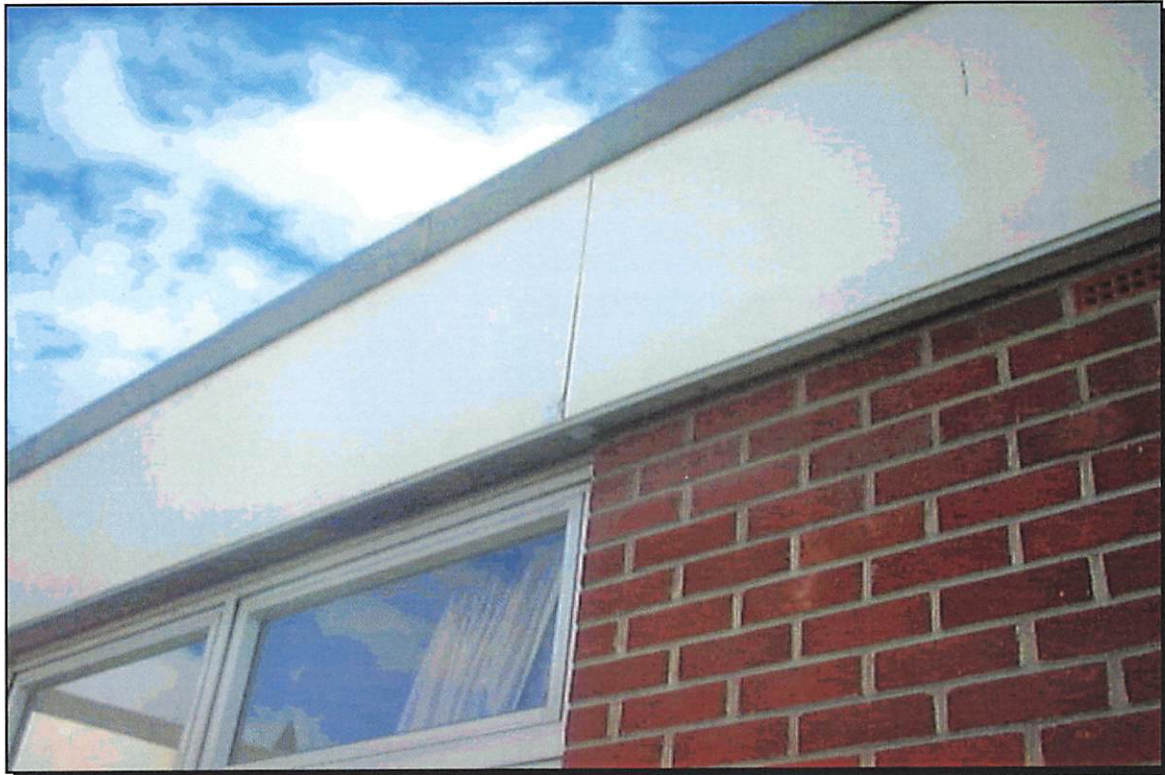
Photograph Number: 15

Site ID: DEA/01283/3/GLEN Location ID: GLEN/123 Building: Floor: Room / Area: Exterior Description: Board under external fascia