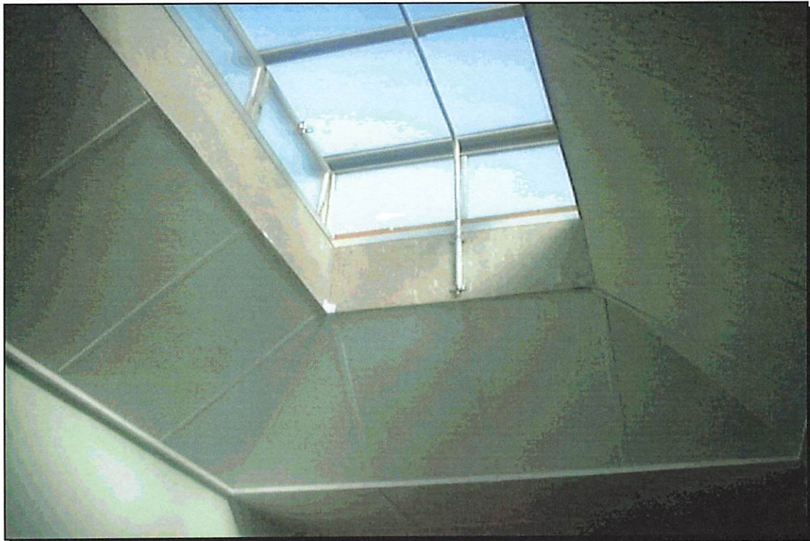
Photograph Number: 6

Site ID: DEA/01283/3/GLEN Location ID: GLEN/114 Building: Floor: Room / Area: Main Corridor Description: Vertical skylight panels