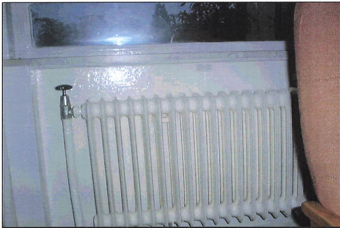
Photograph Number: 86