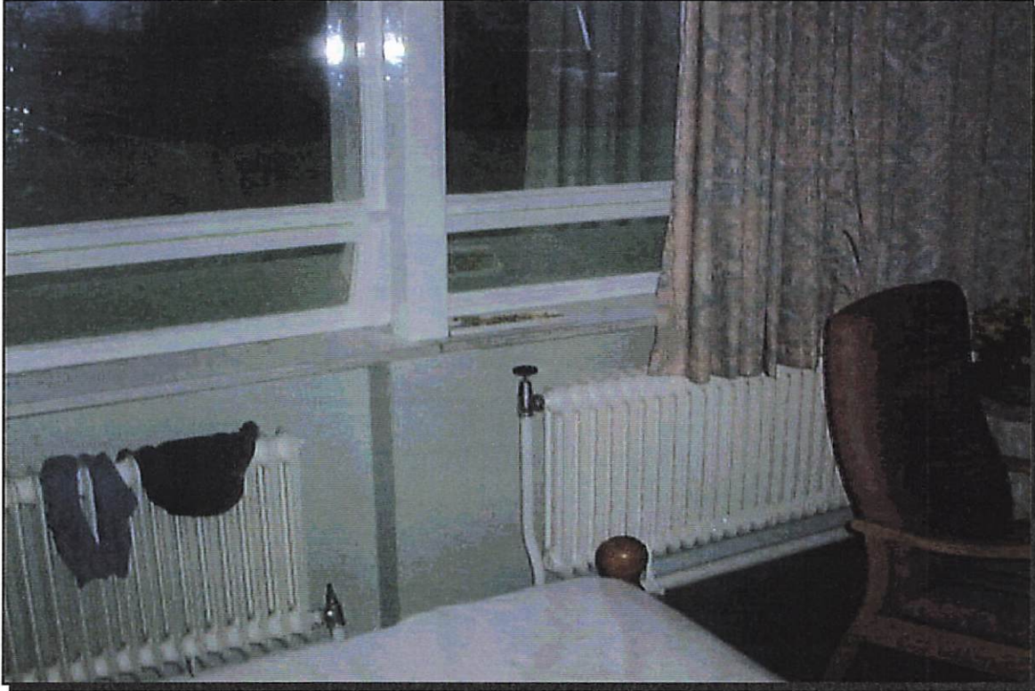
Photograph Number: 88