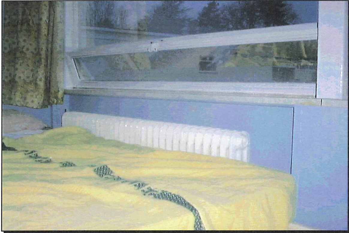
Photograph Number: 93