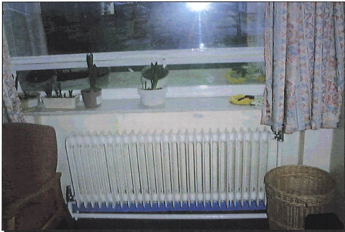
Photograph Number: 96

Site ID: DEA/01283/3/ISCA Location ID: 3/205 Building: Isca Ward Floor: Room / Area: O/T Room 42 Description: Panels behind radiators