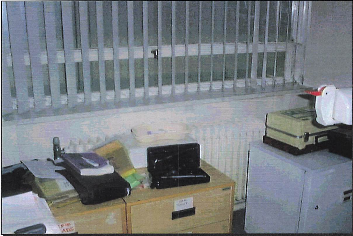
Photograph Number: 89