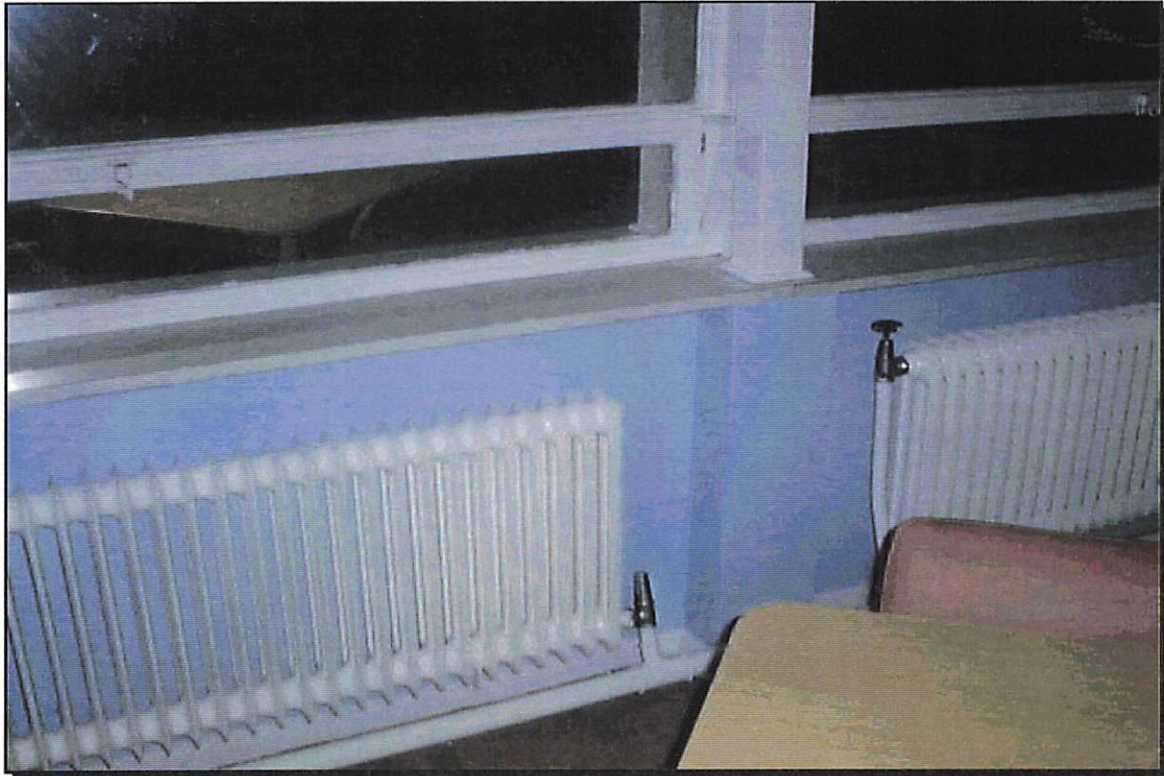
Photograph Number: 85