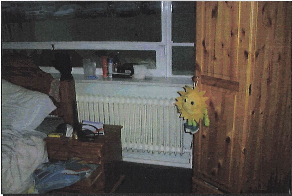
Photograph Number: 92