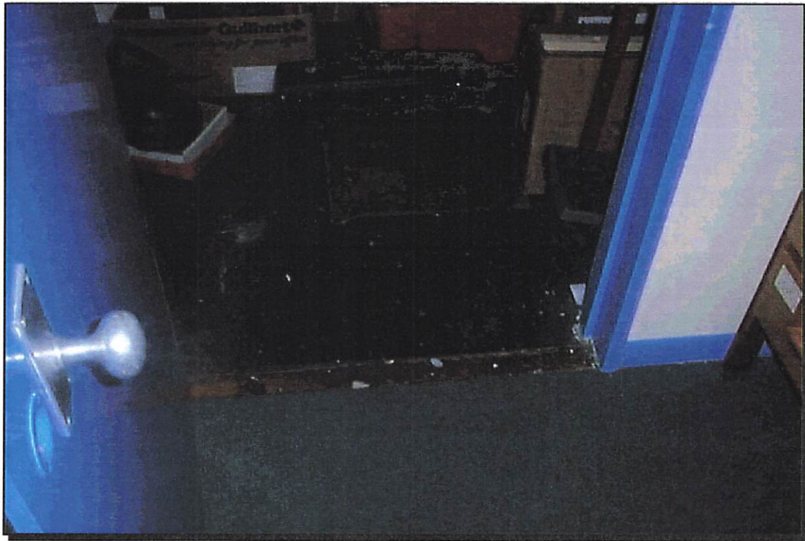
Photograph Number: 95