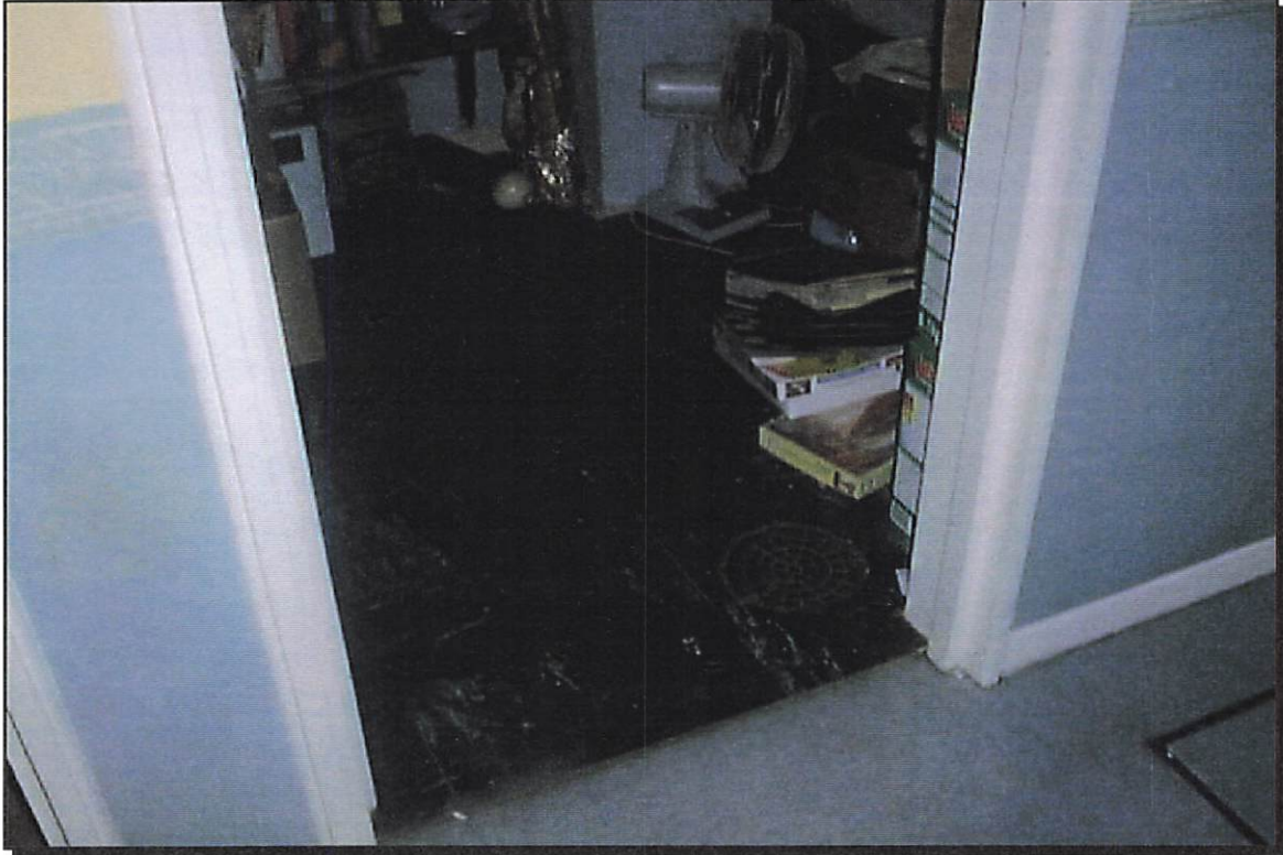
Photograph Number: 90

Site ID: DEA/01283/3/ISCA Location ID: 3/199 Building: Isca Ward Floor: Room / Area: Store Room 50 Description: Floor tiles