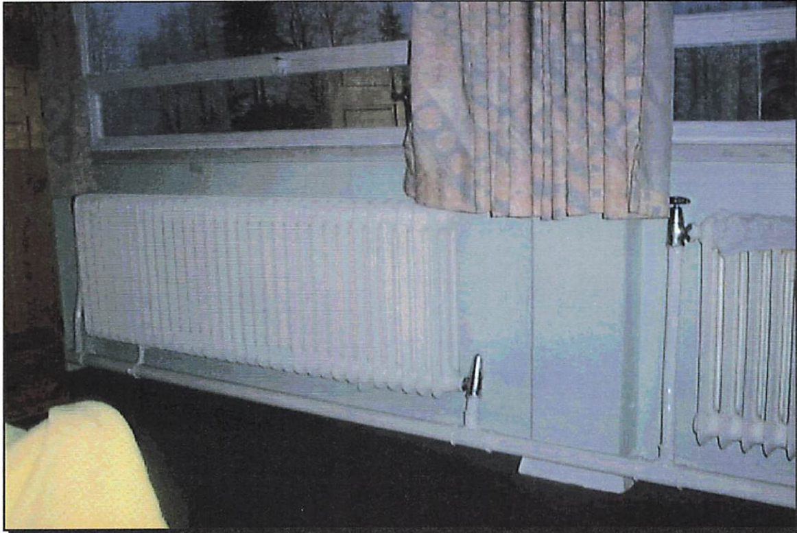
Photograph Number: 87