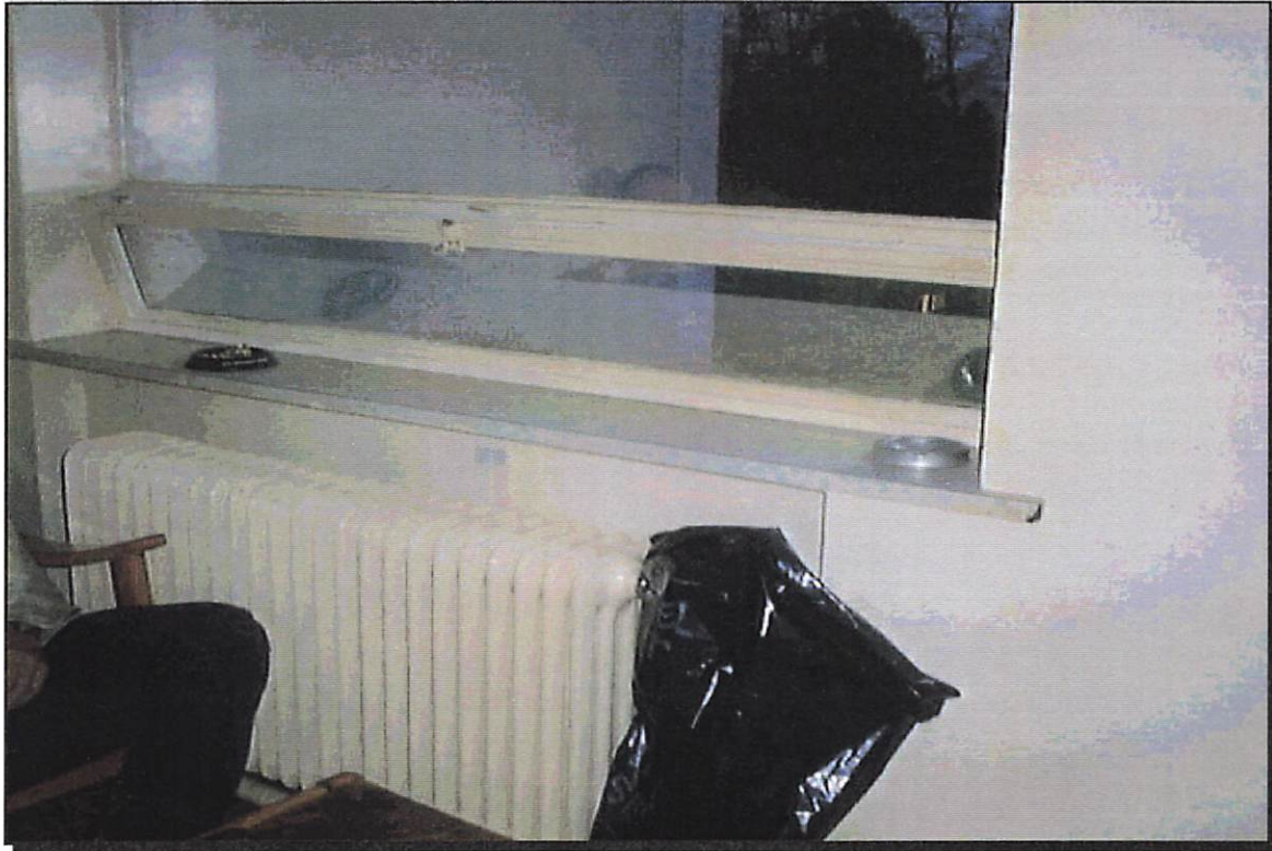
Photograph Number: 91