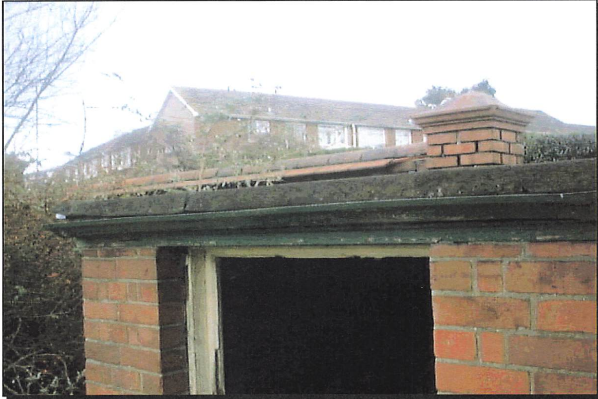
Photograph Number: 19

Site ID: DEA/01283/3/LOD Location ID: LOD/128 Building: South Lodge Floor: Room / Area: Water meter shed Description: Roofing felt