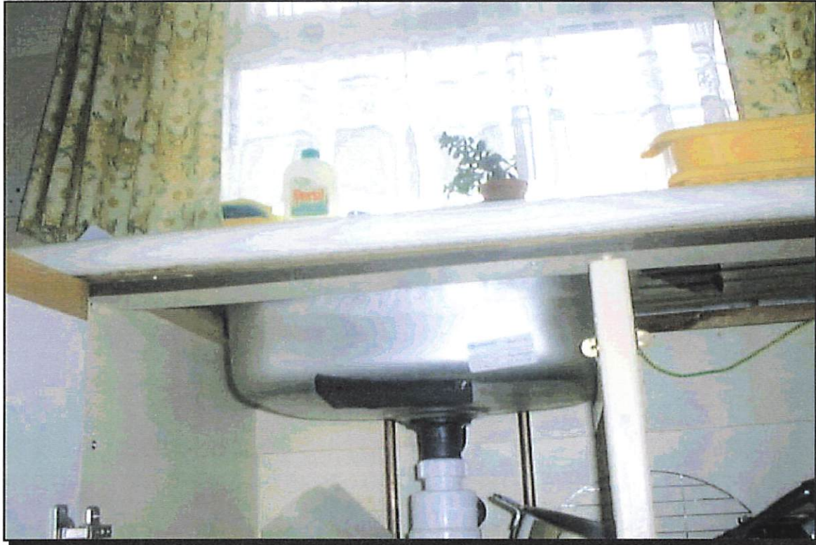
Photograph Number: 20

Site ID: DEA/01283/3/LOD Location ID: LOD/129 Building: North Lodge Floor: Room / Area: Kitchen Description: Sink pad