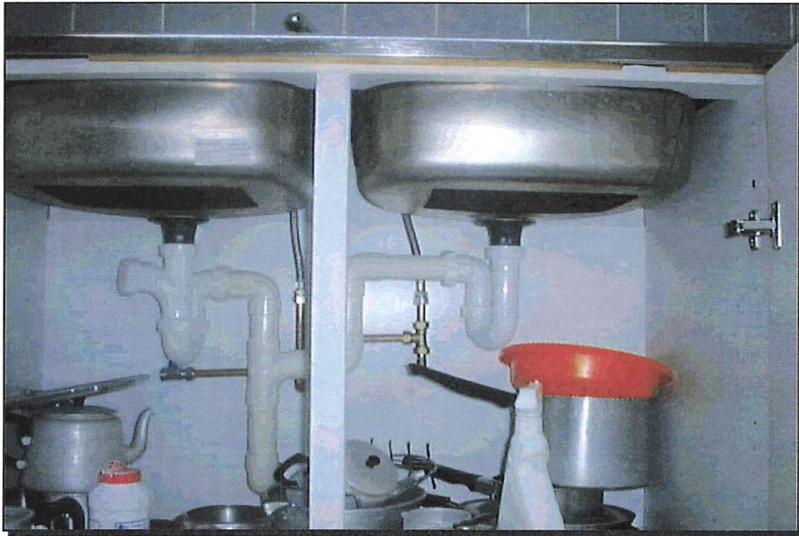
Photograph Number: 14

Site ID: DEA/01283/3/PILL Location ID: PILL/122 Building: Pillmawr Ward Floor: Room / Area: Kitchen P17 Description: Sink pads