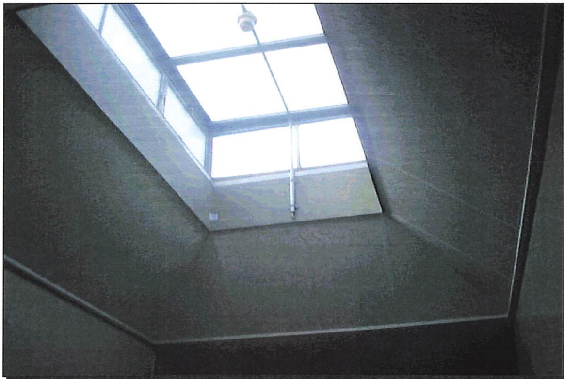
Photograph Number: 13