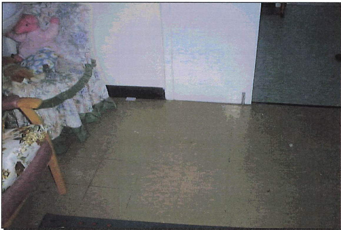
Photograph Number: 12