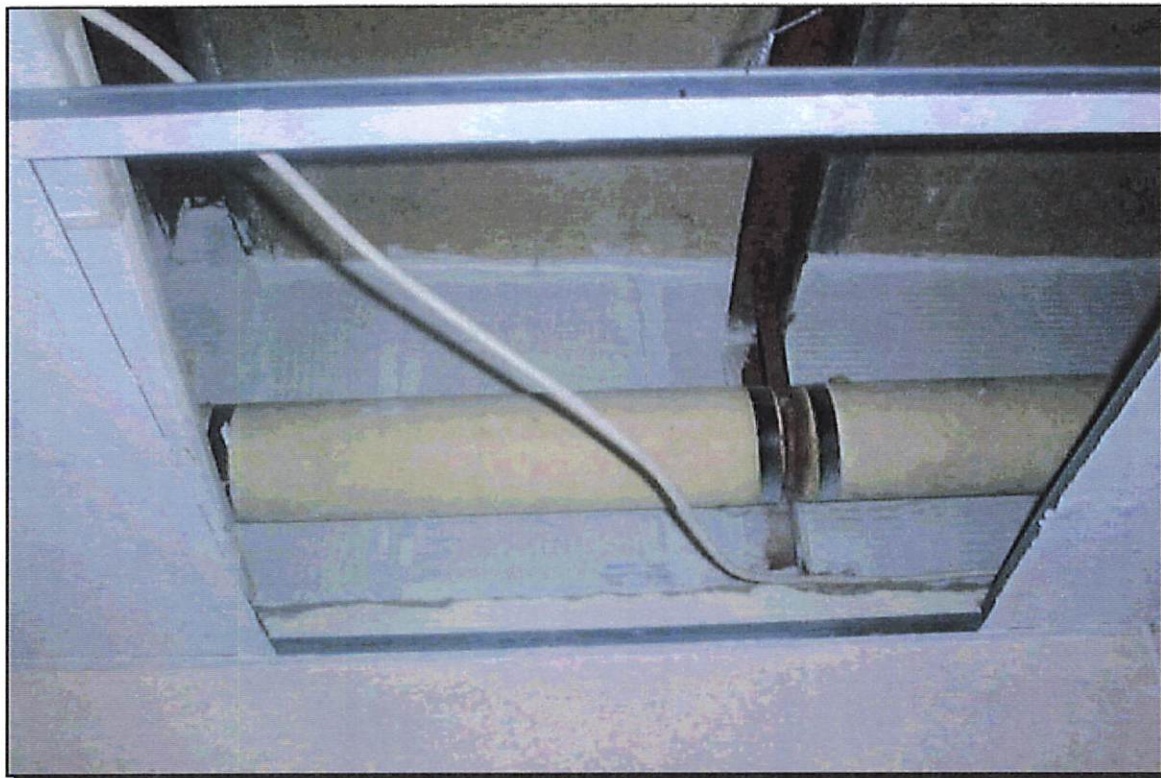
Photograph Number: 11