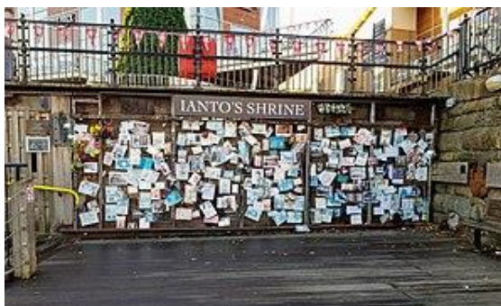
Ianto's shrine in Cardiff Bay

G areth David-Lloyd, Welsh actor and writer born on 28 March in Bettws, Newport, is best known for his role as bisexual Ianto Jones in the science fiction series Torchwood .