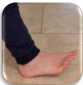
Normal heel-toe walk