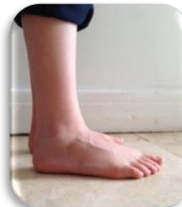
If the child can keep the heels down whilst squatting then he / she has good ankle movement.

Some activities for strengthening your legs are: walking on uneven ground including slopes, trampolining, kicking legs in the pool, cycling, walking along a line / stepping stones etc, standing on one leg eg kicking a ball.